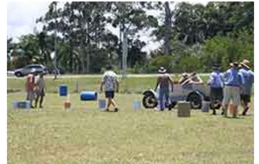
Must be an Olympic Event with all the judges and officials!