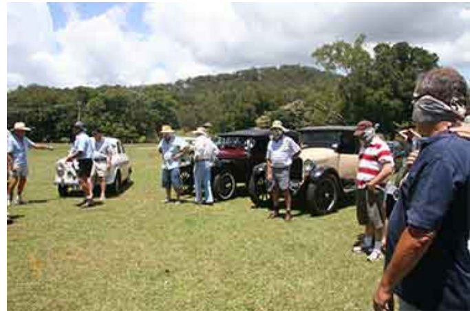
Now where did I leave my car?