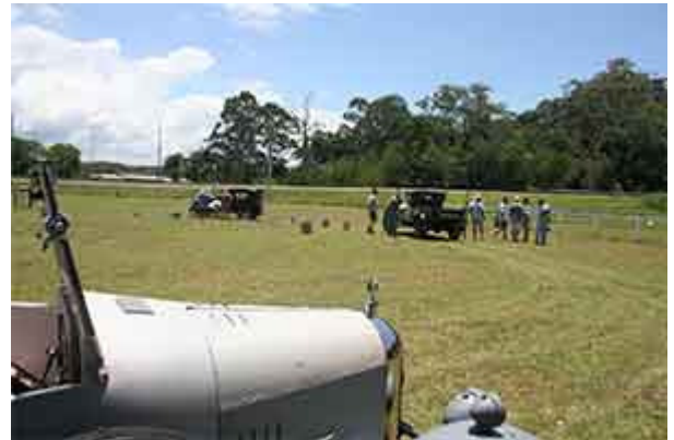
HURRY UP I COMING I CANT STOP THIS BEAST