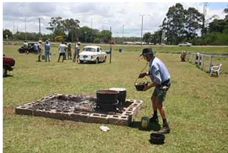
Bevin worked the rest played.