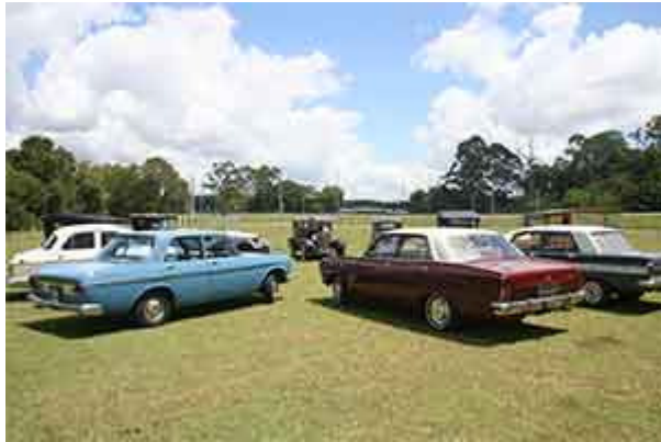
Gathering of the wagons! I mean sedans.