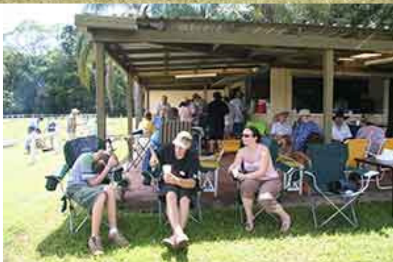
I Hope Dad doesn't scratch the car!