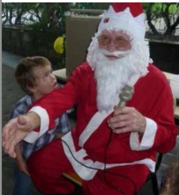
Oh Santa please don't forget me.