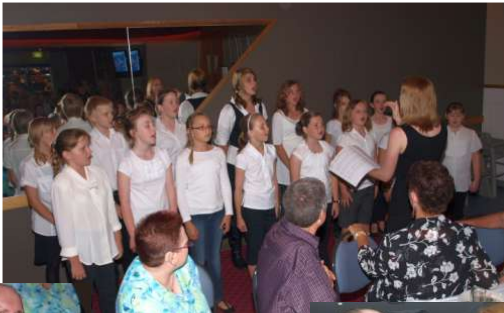
Above: The Beerburrum school choir entertain our members at the President's dinner

Sad to say, you will not see many new faces on the committee which is published in the inside cover of the newsletter. Are there no newish members willing to take a part of running the club which provides for their enjoyment?