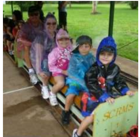
The rain didn't dampen the spirits of these happy little riders, thanks heaps for a fun day!