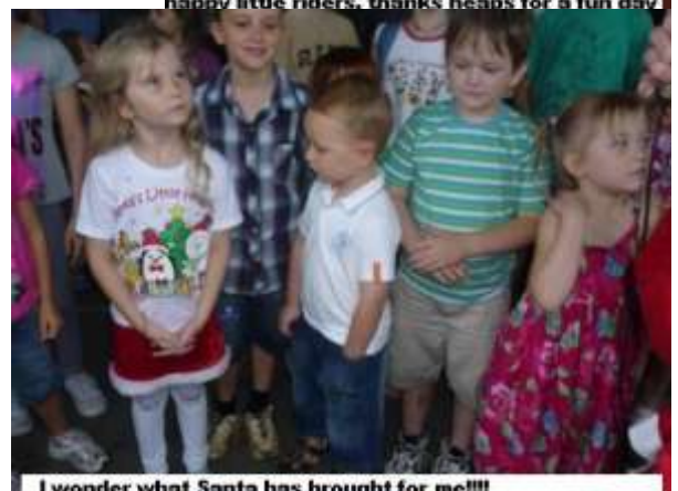
I wonder what Santa has brought for me!!!!