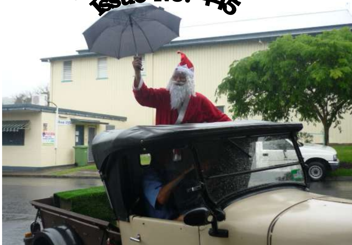
Santa drops in on the Children of SCACC members Thank you Santa for braving the pouring rain